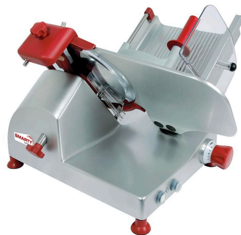
Smarty 300 IX (Red)