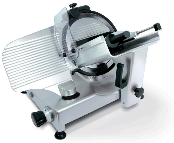
Smarty 300 IX (Black)