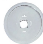
Teflon Coated Blade